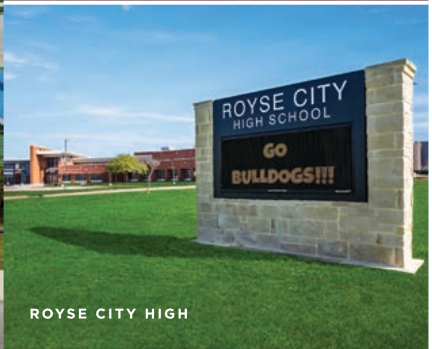
ROYSE CITY HIGH