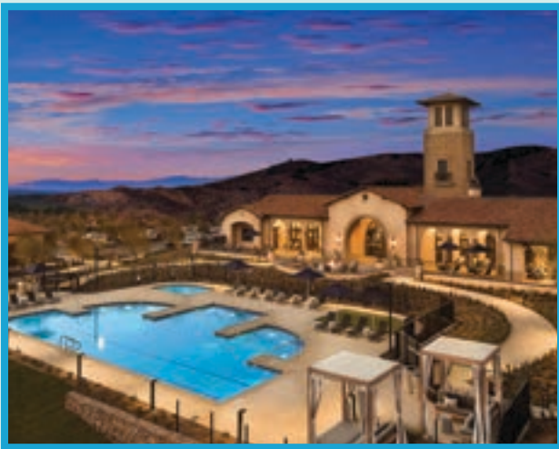
TERRAMOR - LOS ANGELES

In 2025 Starwood Land acquired 11 master-planned communities comprising more than 16,000 homesites and 600 acres of commercial property in three of the Top Ten largest U.S. new home markets – Dallas, Houston and Austin. In 2025, for the third consecutive year, Starwood Land's Sunterra in Houston is the #1 selling community in Texas.