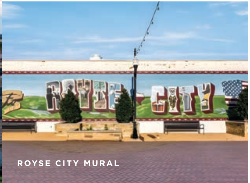
ROYSE CITY MURAL