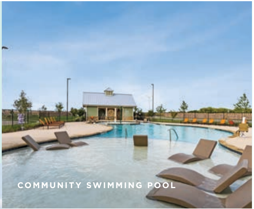
COMMUNITY SWIMMING POOL

With easy access to Highway 66 and I-30, Creekside is convenient to a wide variety of restaurants, shopping, entertainment and recreation in Royse City and in Metro Dallas. The community has a small town feel, but offers all the advantages of the big city. Now is the time to discover the Creekside lifestyle!