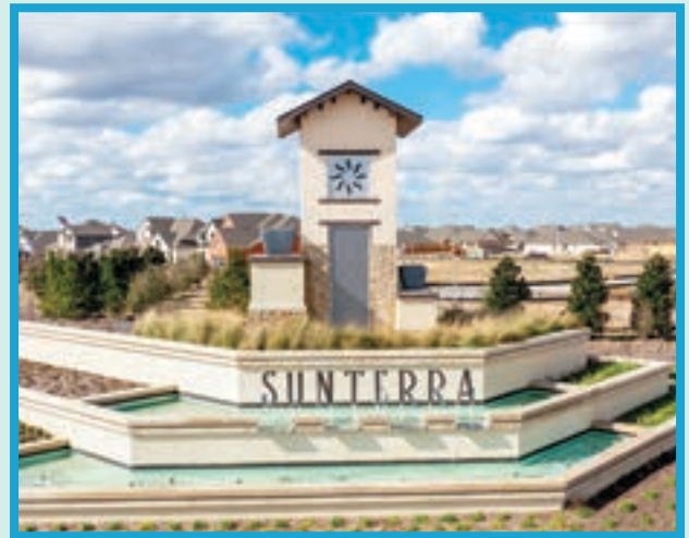
SUNTERRA - HOUSTON