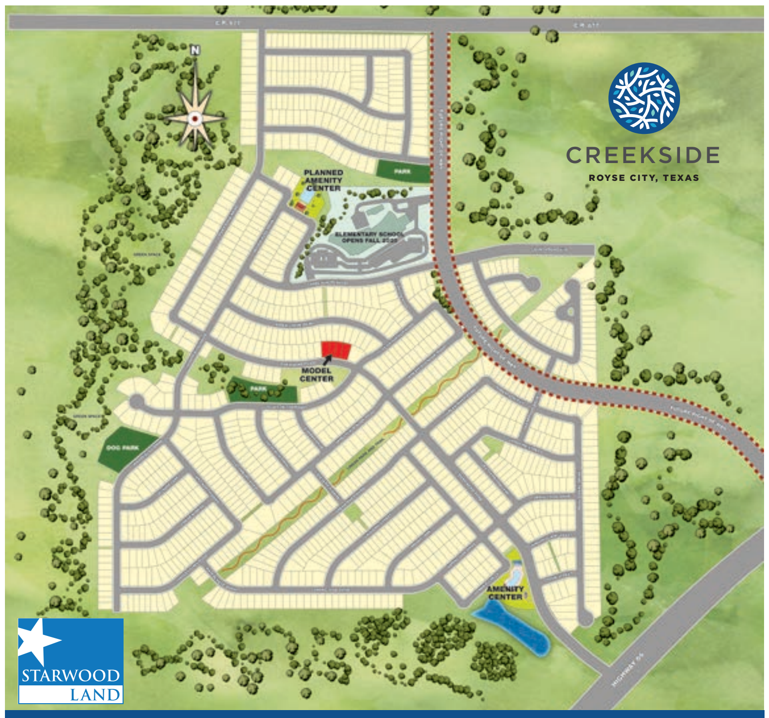
Site plan is for conceptual purposes only and is subject to change without notice. Landscaping depicted is not to scale and may vary as to majority and number. The Planned Amenity Center renderings are the artist's concepts. Prices, terms, features and availability are subject to change without notice.