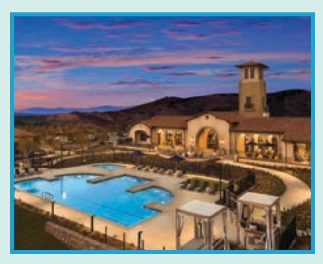
TERRAMOR - LOS ANGELES

In 2025 Starwood Land acquired 11 master-planned communities comprising more than 16,000 homesites and 600 acres of commercial property in three of the Top Ten largest U.S. new home markets – Dallas, Houston and Austin. Sunterra in Houston, a Starwood Land community, was the #1 selling community in Texas in 2023 and 2024.